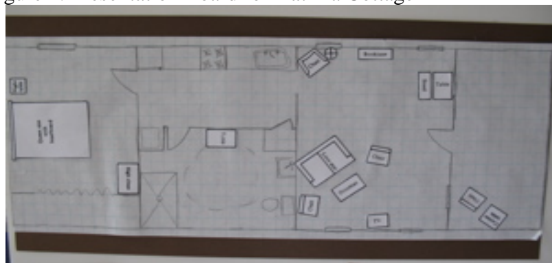
Figure 2. Floor Plan for Katrina Cottage